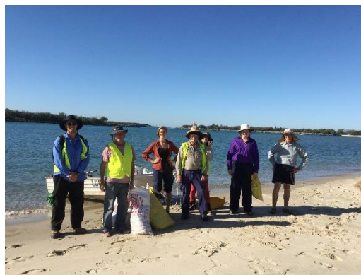
CVA removed 75 cubic metres of marine debris weighing 2 tonnes from project sites.

Louise Duff Program Manager Wetlands Catchments Coasts Conservation Volunteers Australia lduff@cva.org.au M: 0432 688775